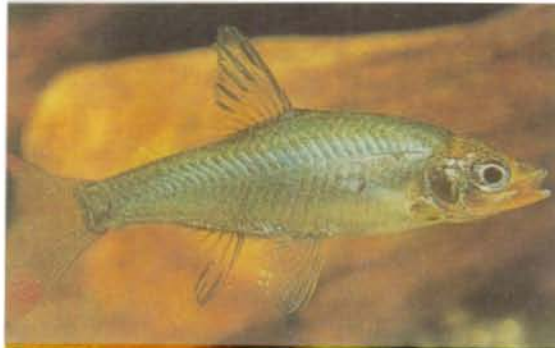
A. Sawbwa resplendens Annandale, 1918