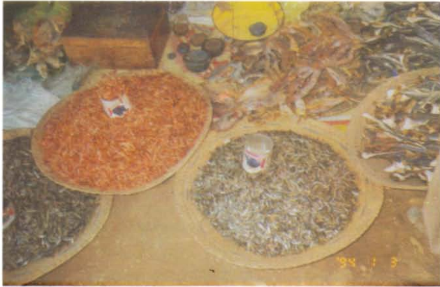
A. Various species of dried ornamental fish in the market