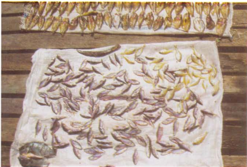
B. Sun drying ornamental fish

Plate V Misused of ornamental fish in Inlay Lake