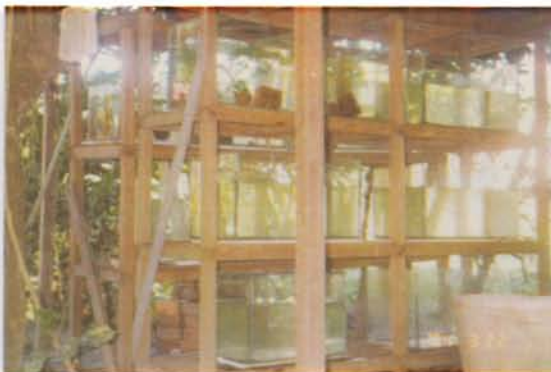
D. Fish keeping aquaria