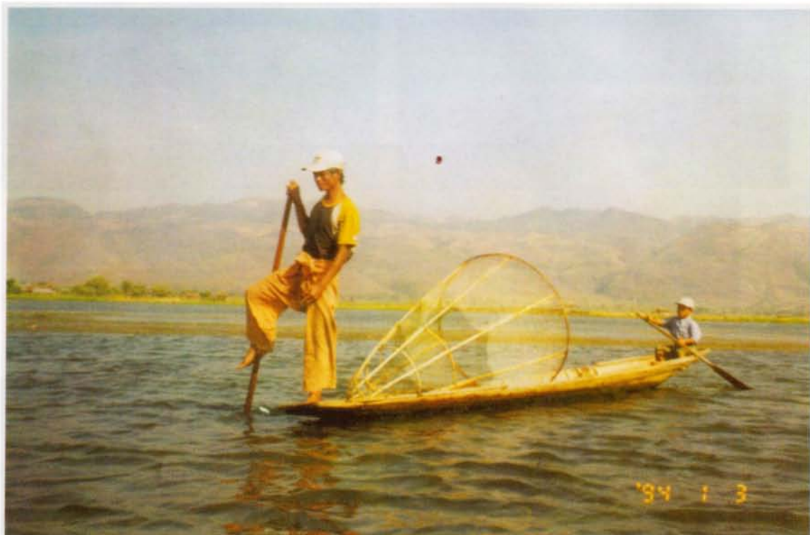
Plate I Inlay Lake