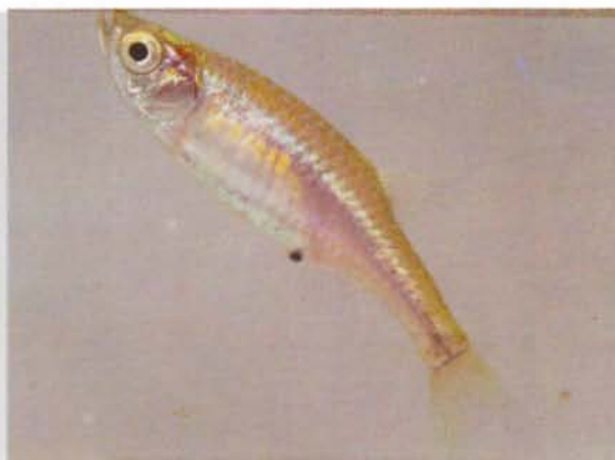
D. M. rubescens Annandale, 1918