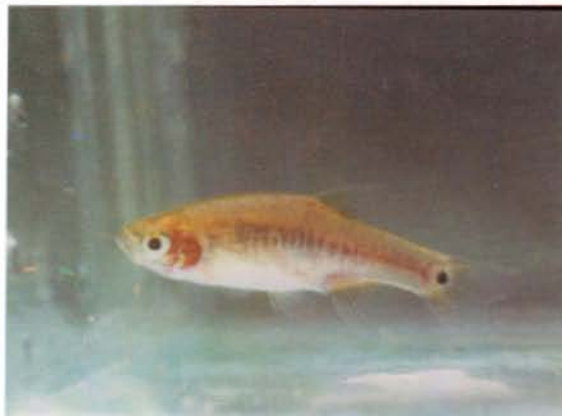
C. Microrasbora erythromicron Annandale, 1918