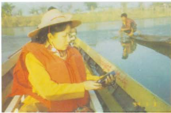
A. Measuring the location in the lake used with GPS