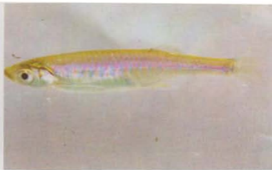
B. Inlecypriis auropurpureus (Annandale, 1918)