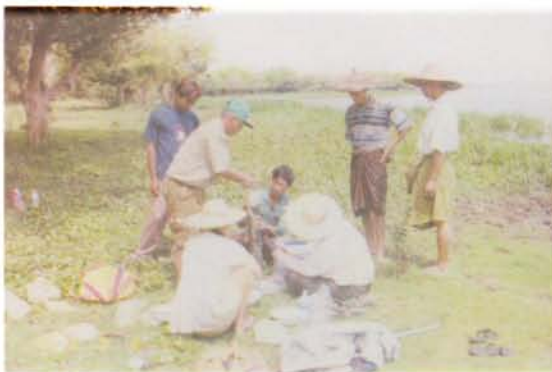
C. Preparation for transporting the ornamental fish