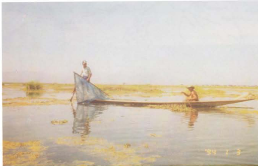
A. Triangular push net