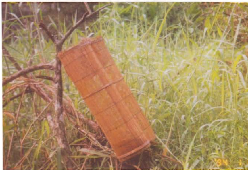
B. Bamboo trap