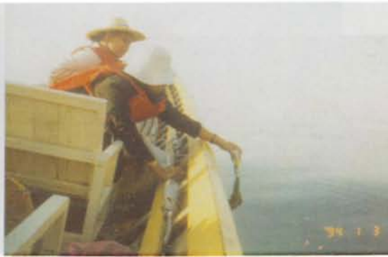
B. Measuring the water quality